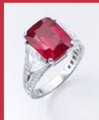
Ruby and Diamond Ring, featuring the Graff ruby weighing 8.62 carats Price Realized : $8,600,000